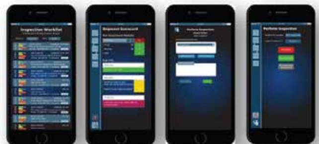
(RiskLab Inspector Mobile Application)

RiskLab provides an ability to show inherent risk across multiple threat domains to promote coordination among Customs and Other Government Agencies (OGAs).